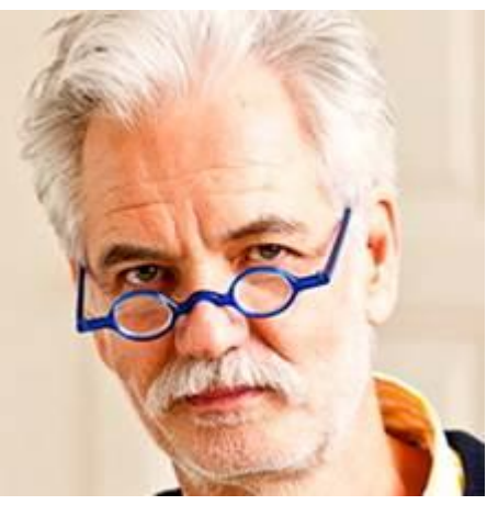
Presentation title to be defined