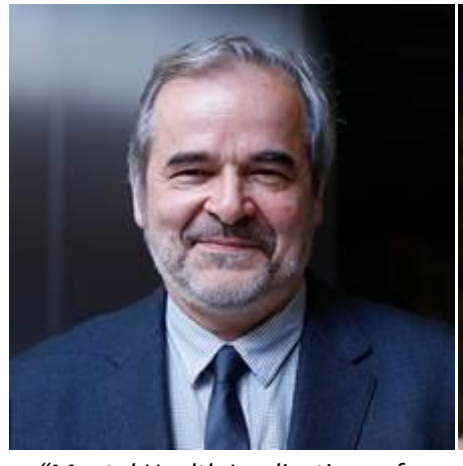
"Mental Health Implications of Excessive Online Searches for Health-Related Information"