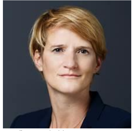
"How to hold on Recovery-Concepts on acute psychiatric wards facing increasing violence between patients and patients towards staff-members?"