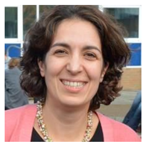
Presentation title to be defined